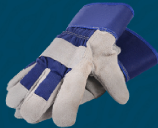
INDUSTRIAL LEATHER GLOVES

WE CATEGORIZE OUR LEATHER GLOVES INTO TWO MAJOR PORTIONS