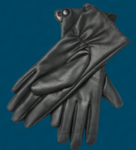
FASHION LEATHER GLOVES